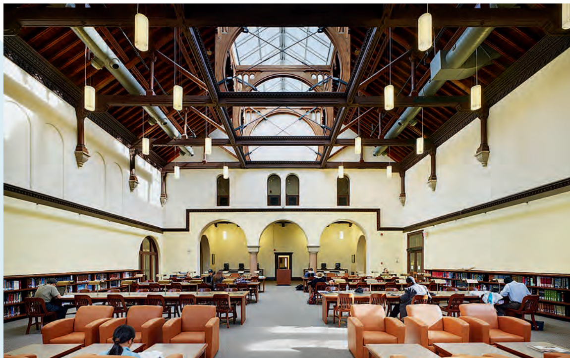
Heritage Reading Room in the Gerstein Science Information Centre