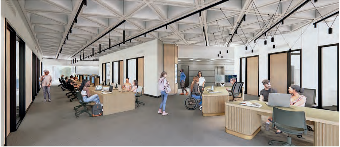
Rendering courtesy of Superkül